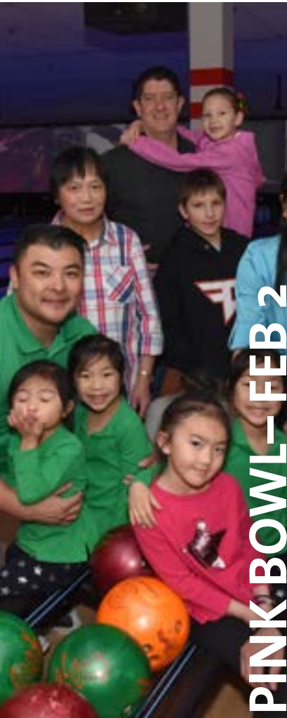
PINK BOWL—FEB 2