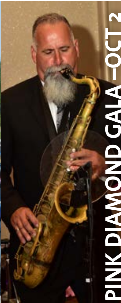
PINK DIAMOND GALA—OCT 2

“Our credit union is built upon giving back to the community, so our Maurer Foundation sponsorship gave us an opportunity to support an important and worthy cause and also enjoy a day of bowling fun with our employees and their families. We are very happy to continue to support The Maurer Foundation!”